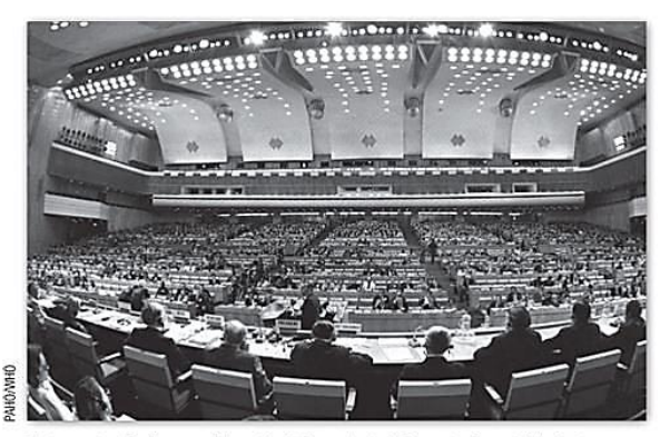
The International Conference on Primary Health Care at the Lenin Convention Center in Alma-Ata in September 1978.

The Alma Alta Declaration (1978) and Astana Declaration (2018) defined a role for community health workers in the delivery of Primary Health Care and emphasized the need for all types of health workers to respond as a health team to the expressed health needs of communities. There is growing global consensus that efforts to bridge health systems and communities through collabo-