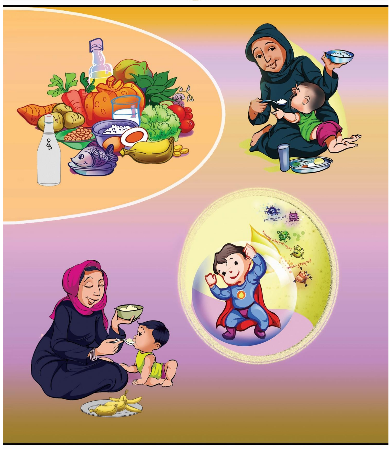
MAY YU FM 90.1 MHz November, 2017