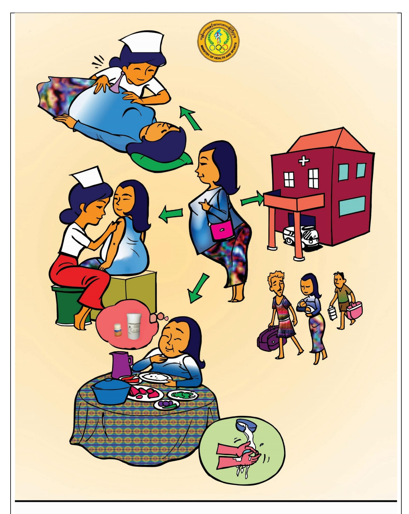
MAY YU FM 90.1 MHz November, 2017